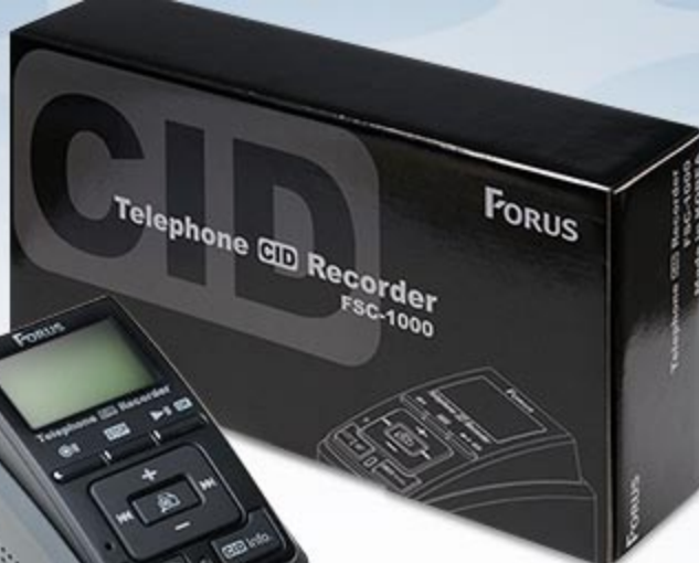
► Packaging Box